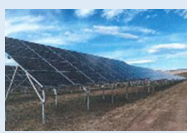
Energy Management (Solar power + storage batteries)