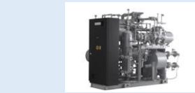
Non-fluorocarbon and highly energy efficient cooling