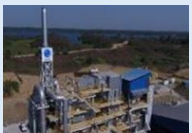
Waste to Energy

Introduction of renewable energy and energy-saving equipment to infrastructure and cities, Highly-efficient energy utilization and management in infrastructure, Introduction of equipment for emissions reduction of pollutants (wastewater, exhaust gas, dust, etc.), Introduction of disaster prevention systems that contribute to climate change adaptation, etc.