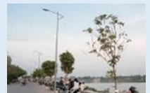
Radio controlled “LED Street Lights”